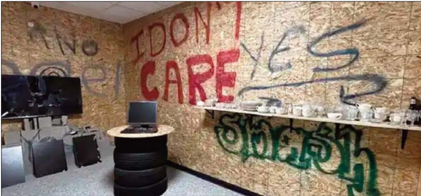
Pictured above is one of the rooms at “The UnSafe Space” for a single rager or group of ragers. For larger bookings, participants will be split into groups of two between five rage rooms.