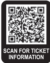
SCAN FOR TICKET INFORMATION

Please consider attending the Taste of the Villages and Auction on April 18th so you can enjoy a taste of the Villages while helping children in our community. Individual tickets may be purchased online by scanning the QR code.