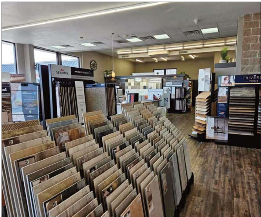
The showroom at KVR Floors & More in Howard provides customers to browse a large selection of samples including their high-quality carpet, tile, laminate, cork, and wood flooring materials.

tication to your bathroom experience with a beautifully crafted tile shower or your kitchen with a custom tile backsplash. They can bring style and functionality together creating a stunning shower space that will stand the test of time. For more information on KVR Floors & More, call or text 920-329-2228 or visit them online at kvrfloorsandmore.com .