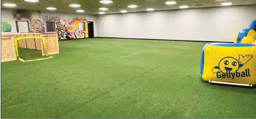
“The UnSafe Space” also provides indoor space to play your own games such as indoor soccer, cornhole and flag football. Depending on the usage, their 2,500+ square foot arena can accommodate up to 50 people.

ing adventure within our 3,000-square-foot indoor arena. Engage in friendly battles and epic challenges with Gellyball, Knockeball, Cornhole, and even human foosball. Whether you’re competing with friends or engaging in team-building activities, “The UnSafe Space” offers an electrifying atmosphere where fun knows no bounds.