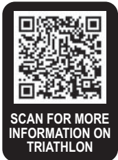
SCAN FOR MORE INFORMATION ON TRIATHLON

Visit villageofhoward.com or scan the QR code for more information about race registration and sponsorship and volunteer opportunities.