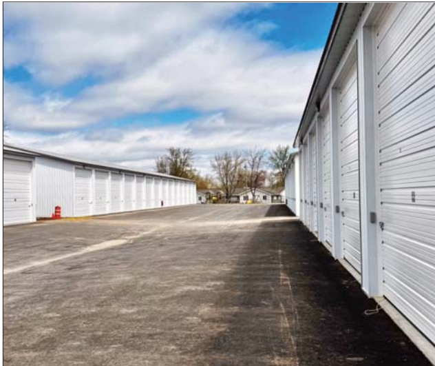
Velp Ave Storage has added 47 brand-new Maxi Storage Units that feature 14-foot-tall electric garage doors with interior lighting and electrical outlets.

Whether you're storing equipment, inventory, or personal items, you'll appreciate their smooth rental process and top-tier safety standards. Visit velpavestorage.com or call 920-786-7834 for more information.